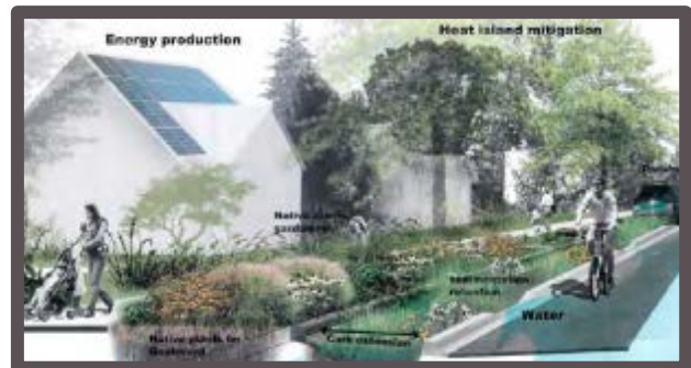
Renderings courtesy of The Cornerstone Group and Metropolitan Design Center