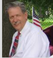
Mayor James Hovland City of Edina